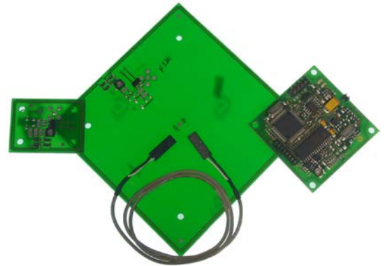
As external antennas, two 50Ω antennas ID ISC.ANT40/30 and ID ISC.ANT100/100 are available.